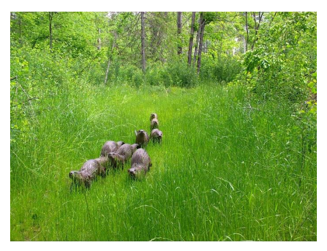
Otter captured by a Snapshot Wisconsin camera in Jackson County, winter 2016. →

In the first two years of the project, 360 photos of otter were captured from 29 camera sites. Most of the photos captured were in spring or late fall, especially in November. Additionally, most of the camera sightings took place between dusk and midnight. In the future, it is anticipated that Snapshot Wisconsin data will be able to assist wildlife management decisions across the state by complementing population estimates, group counts, and ranges of species.