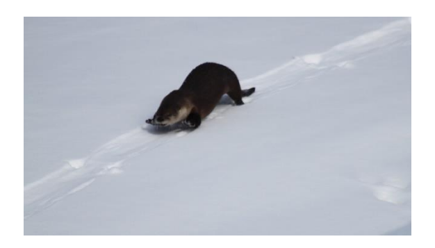
Otter slide marks in snow, photo by CBC News

To gather population information about otters, the WDNR performs a series of aerial surveys to search for the presence of otter slide marks in the snow. Otter are the only species in Wisconsin that produce slide marks as they slide their bodies along ice/snow. Due to the large geographic area of Wisconsin, the state is broken into a series of Otter Transects within Otter Management Zones for which the aircrafts fly over to produce a sample count . Sample counts involve gathering population information about small, controlled areas and using them to produce population estimates for a larger geographic area. This is in comparison to a total count , where every individual of the intended geographic area is counted. Due to the nature of these surveys, weather plays a crucial role in determining how valid the data are. Mild winters may not produce enough snow to accurately generate estimates. Additionally, information on otter populations is collected from trappers and road kill incidents. In 2016, the estimated otter population was approximately 11,000 individuals in the state of Wisconsin.