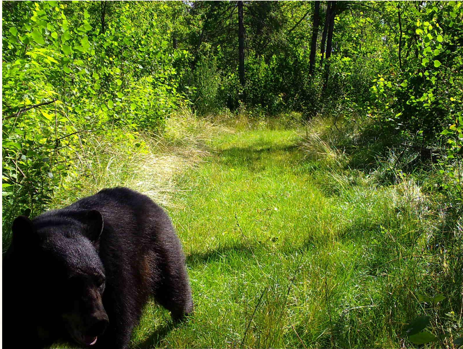
Black bear Ursus americanus