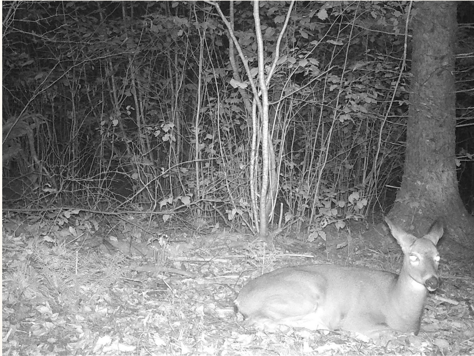
White-tailed deer Odocoileus virginianus