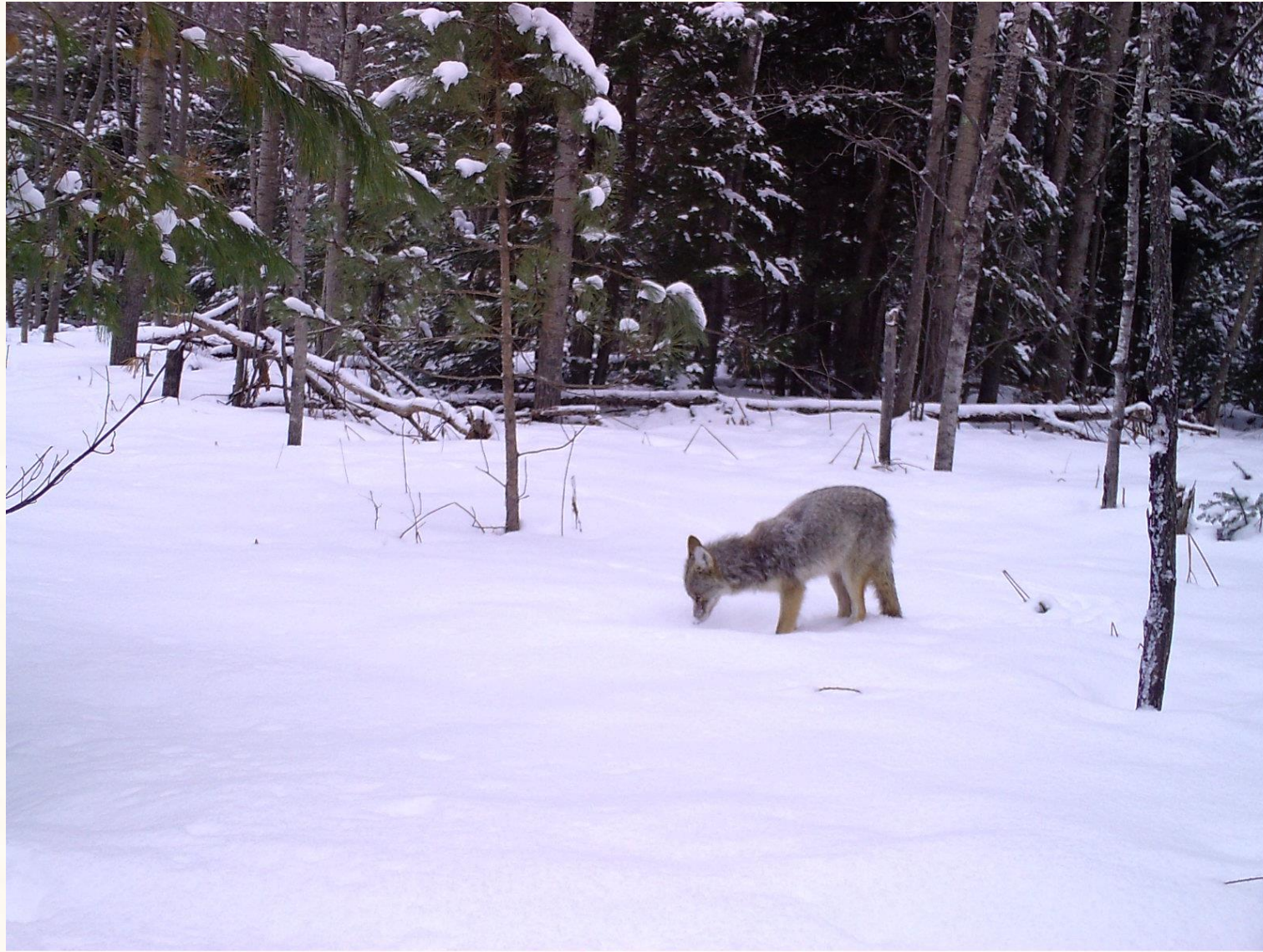
Coyote Canis latrans