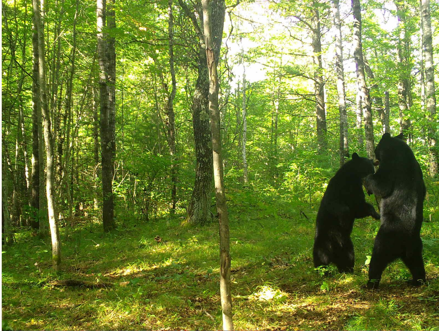
Black bear Ursus americanus