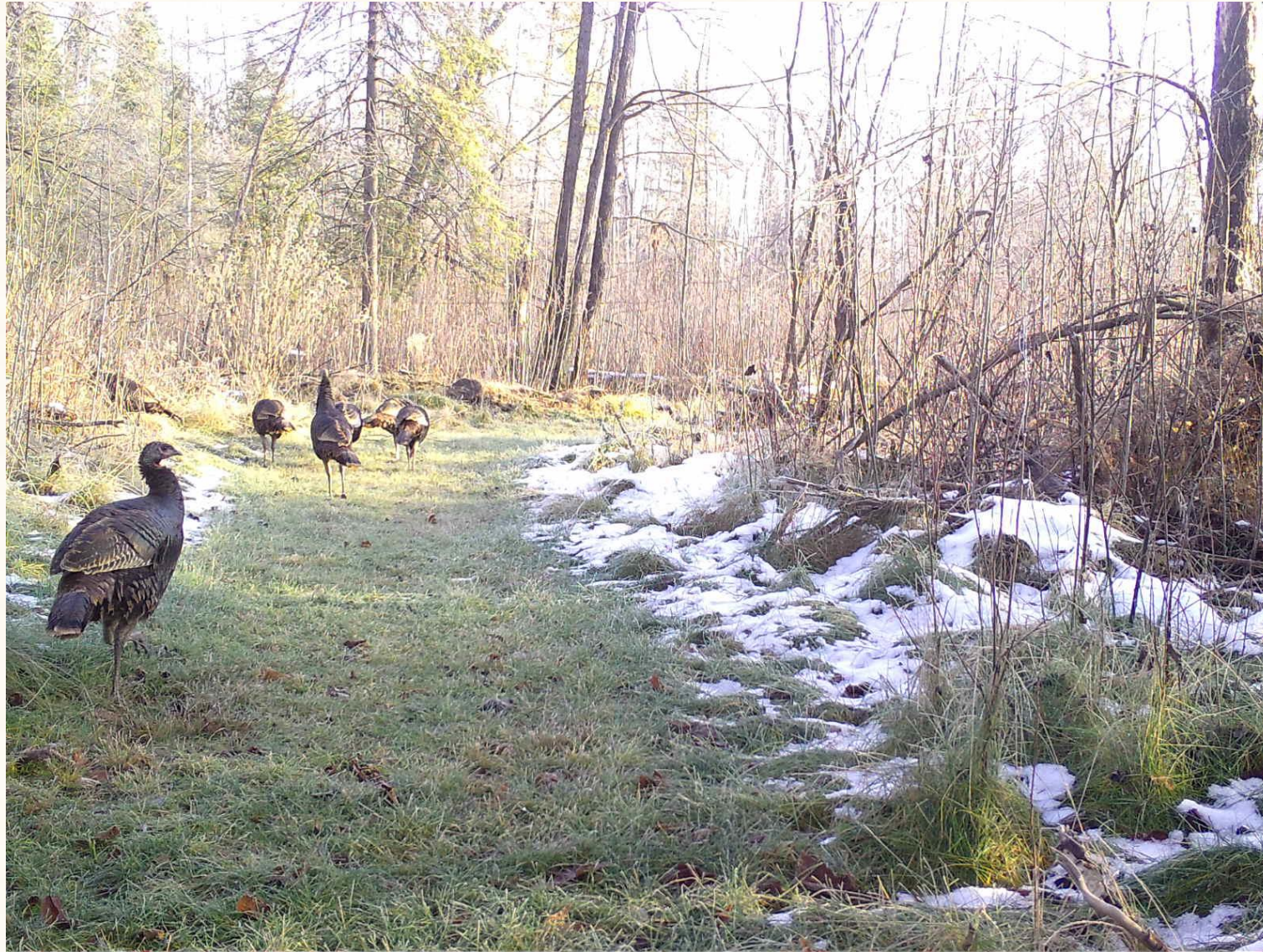
Wild turkey Meleagris gallopavo