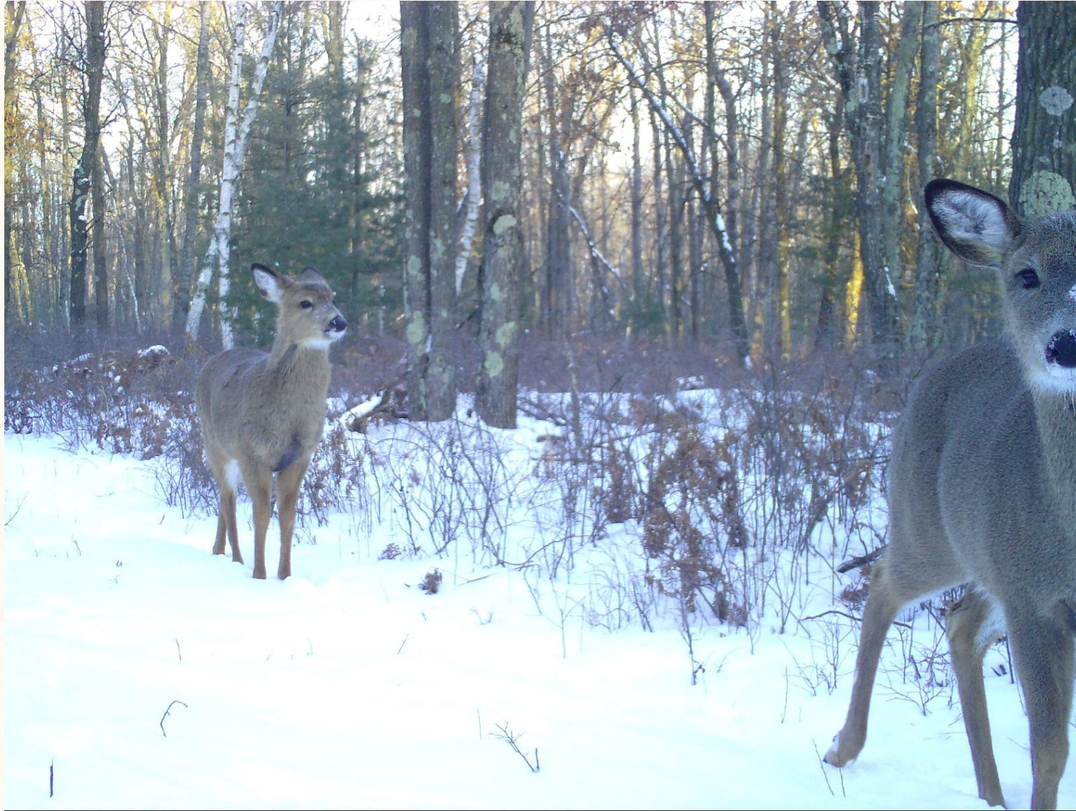
White-tailed deer Odocoileus virginianus