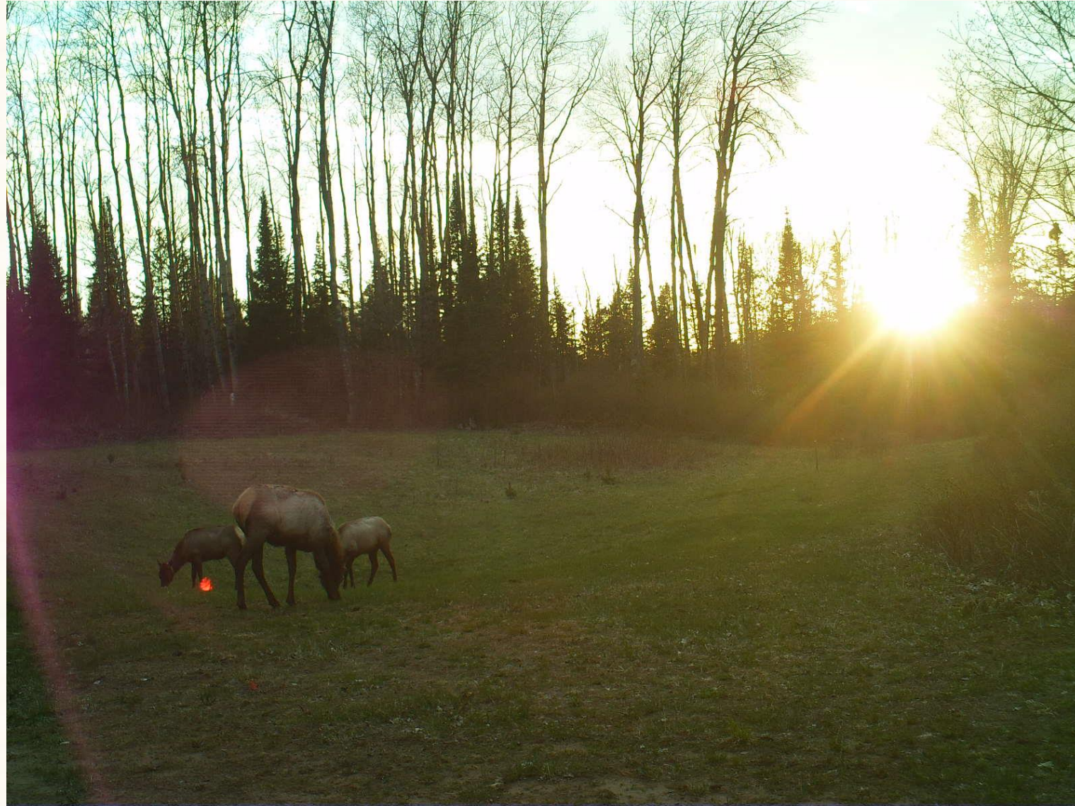
Elk Cervus canadensis