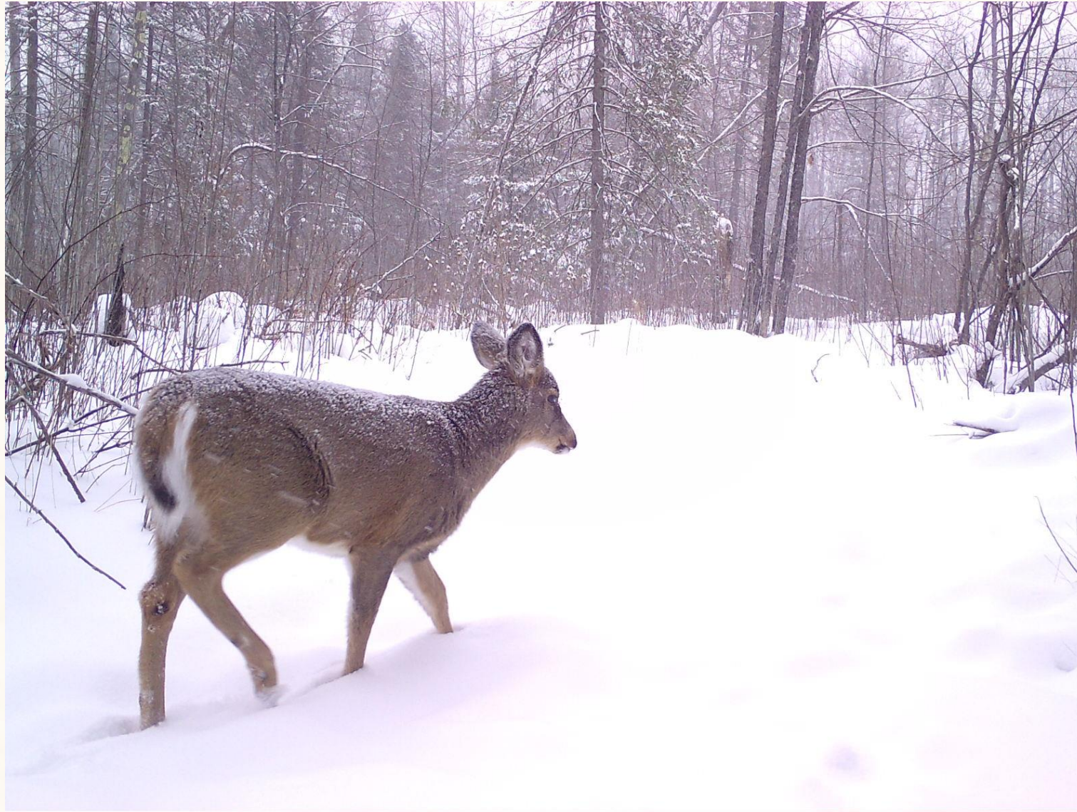
White-tailed deer Odocoileus virginianus