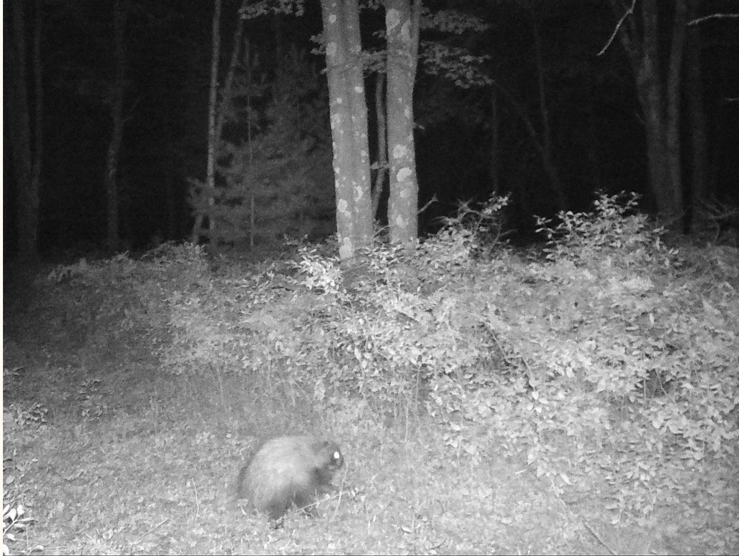
Porcupine Erethizon dorsatum