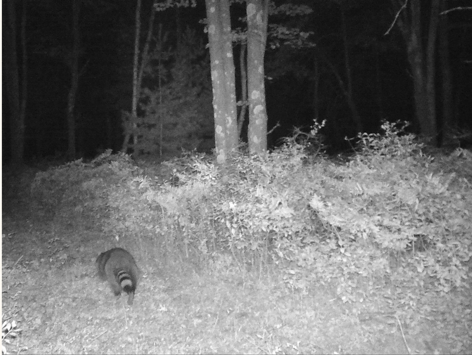
Raccoon Procyon lotor