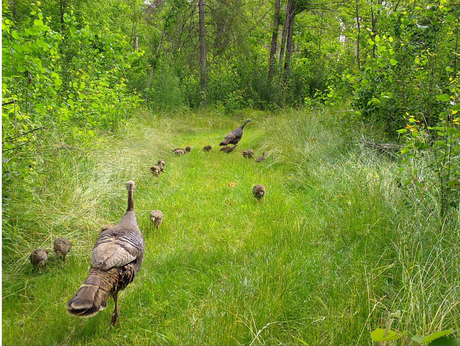
Wild turkey Meleagris gallopavo