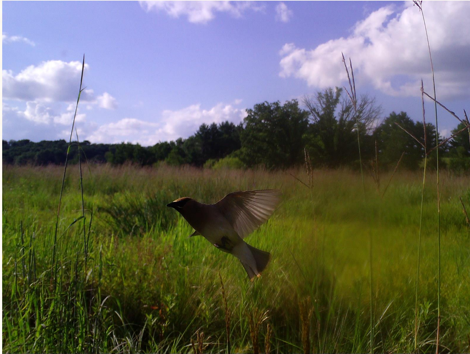
Cedar waxwing Bombycilla cedrorum