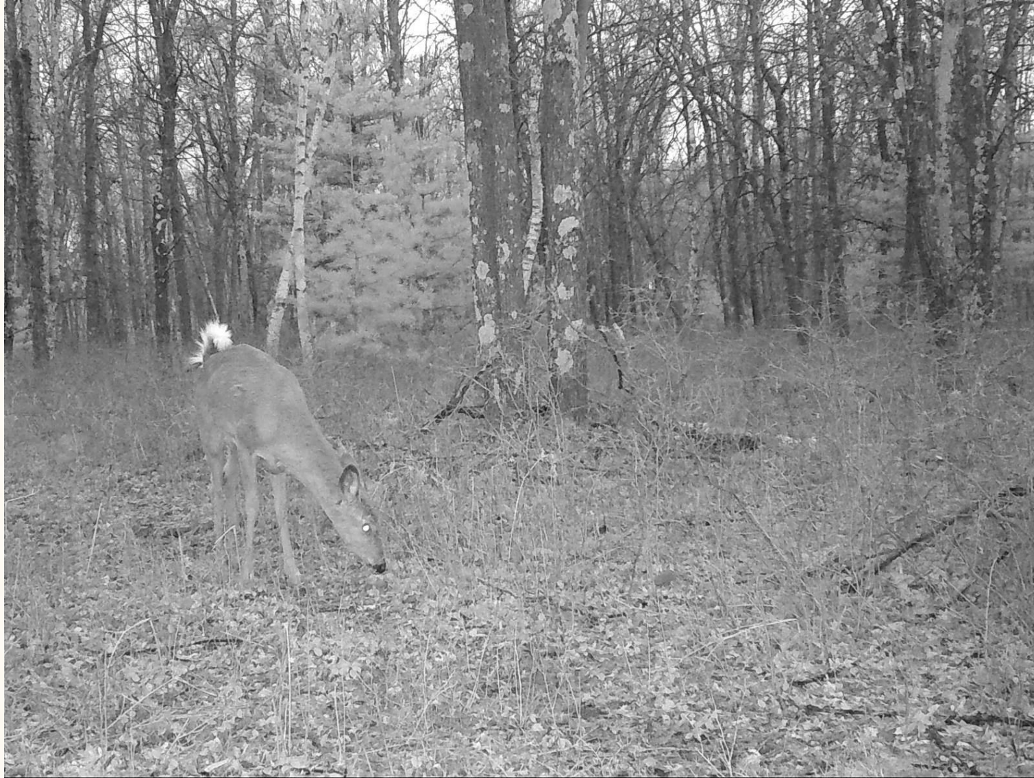
White-tailed deer Odocoileus virginianus