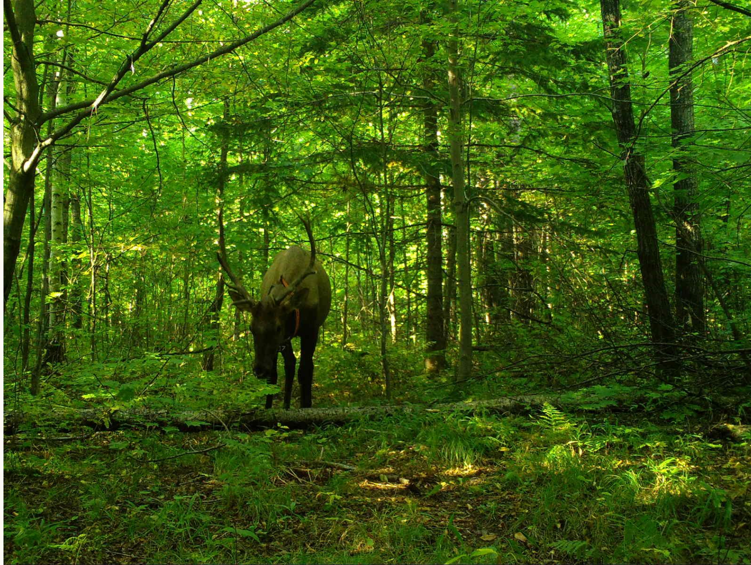
Elk Cervus canadensis