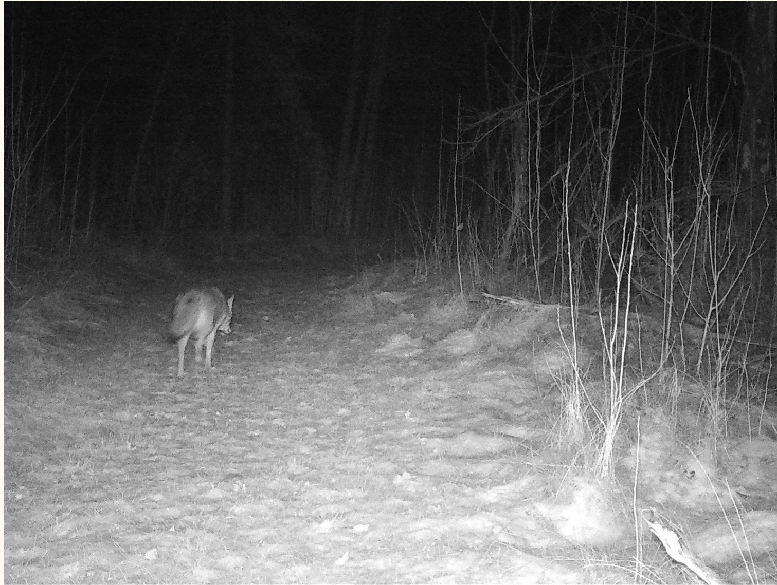
Coyote Canis latrans