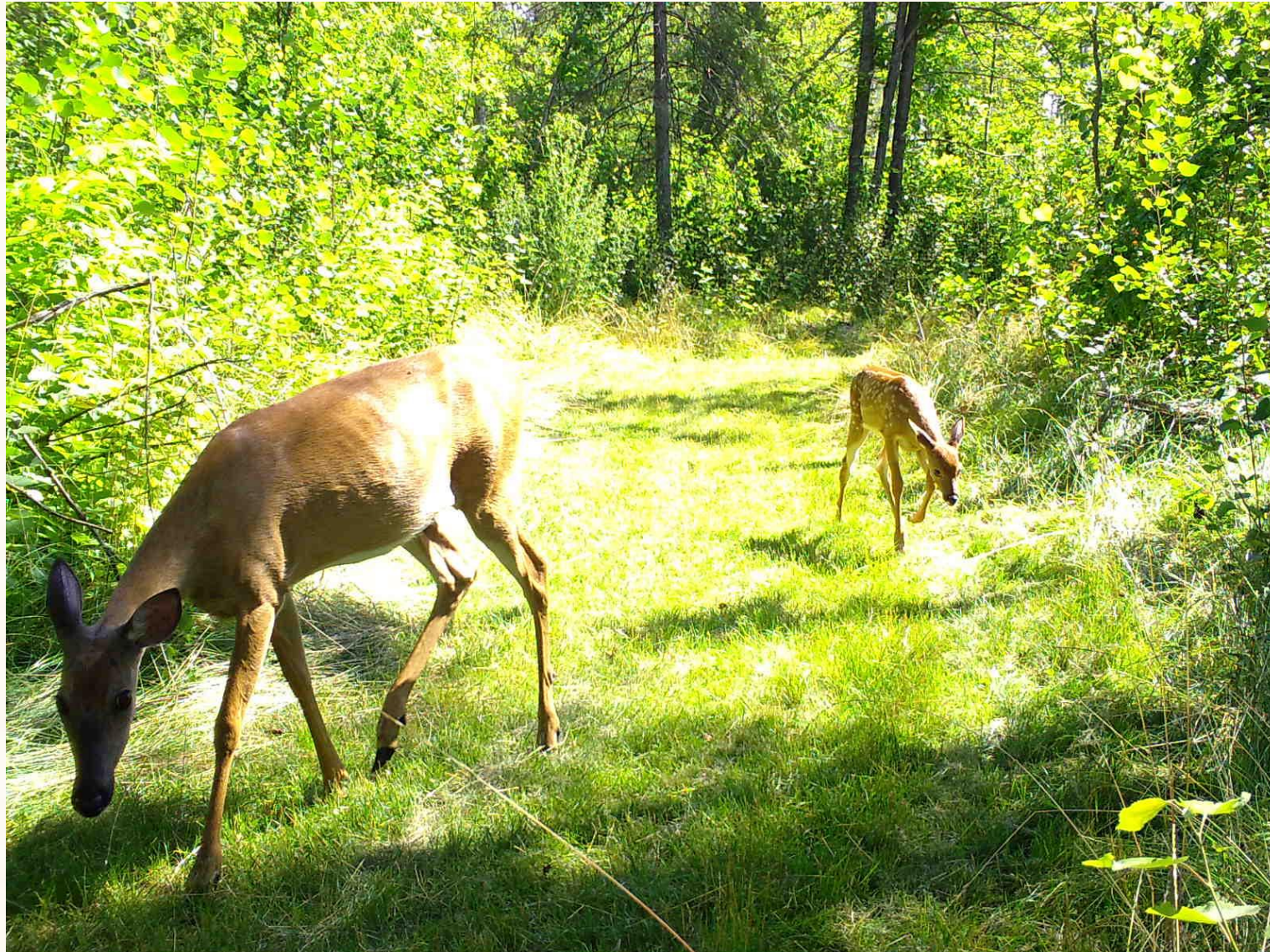
White-tailed deer Odocoileus virginianus