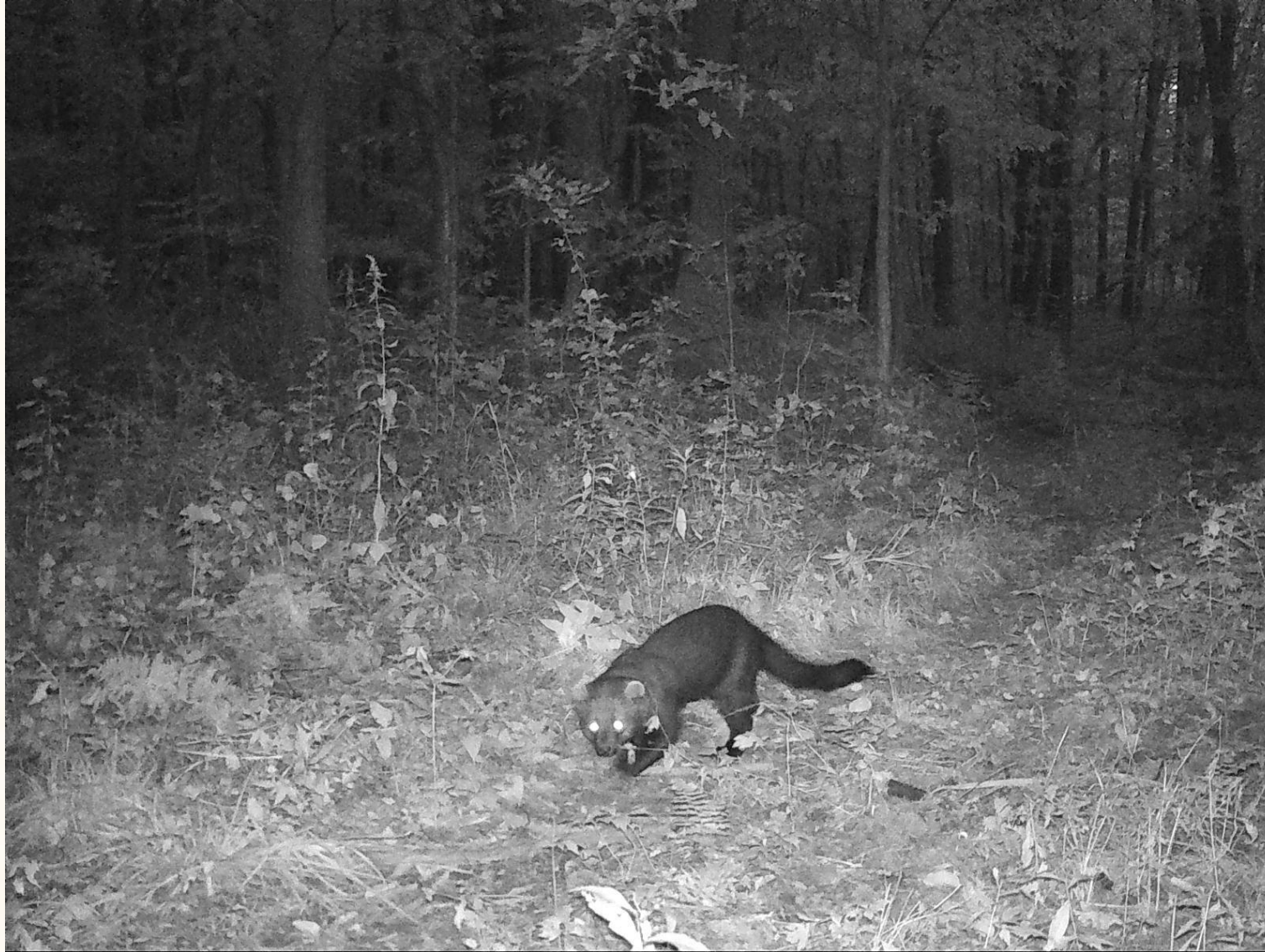
Fisher Martes pennanti