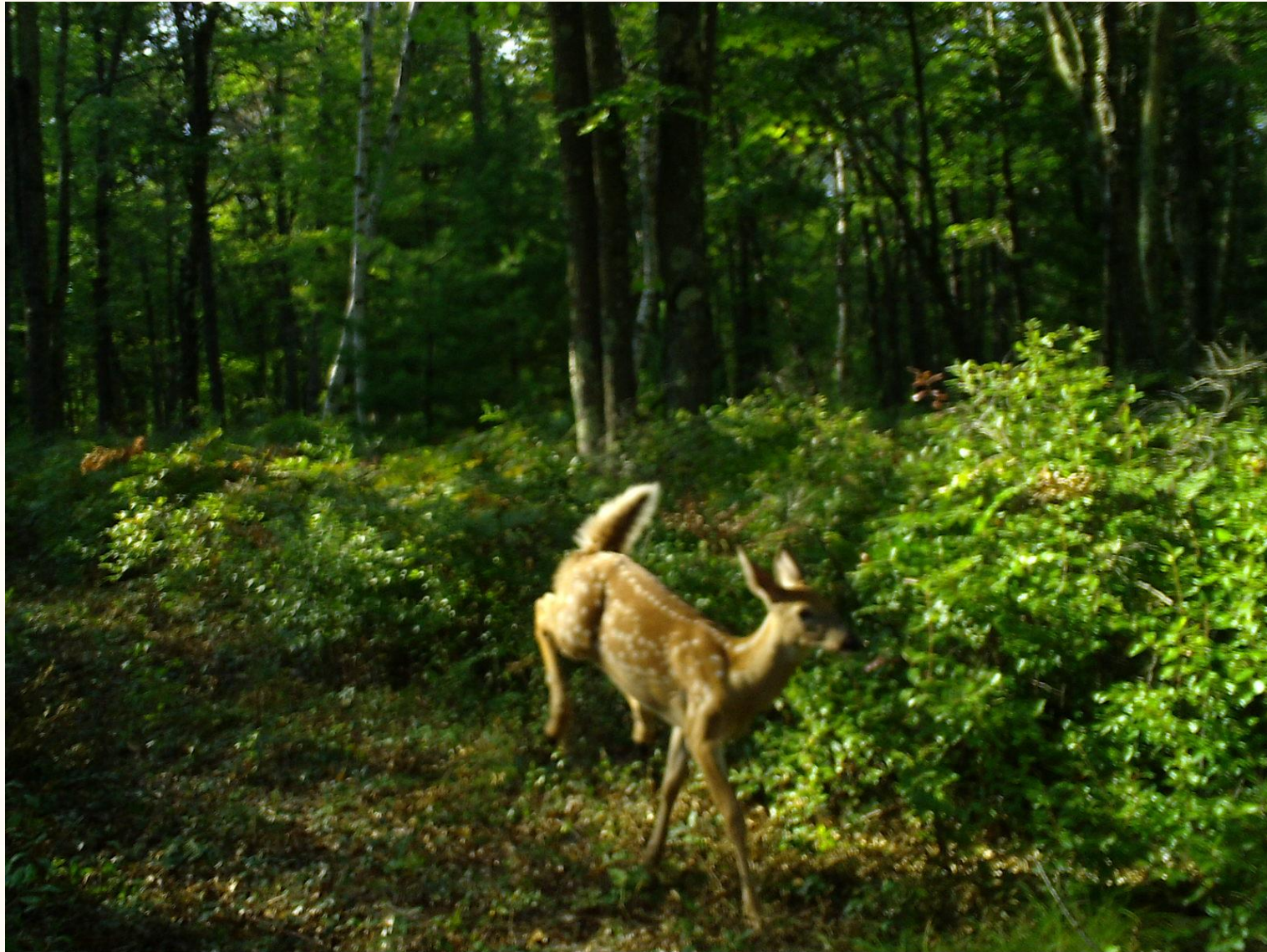
White-tailed deer Odocoileus virginianus