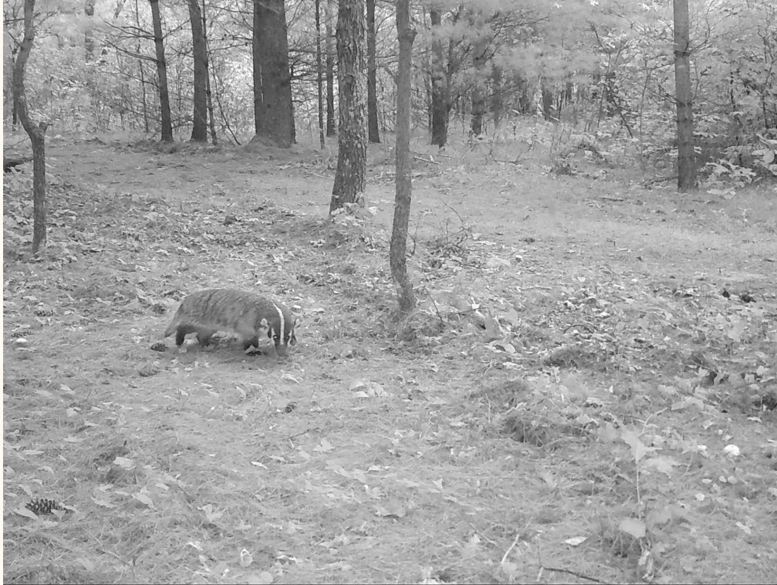
American badger Taxidea taxus