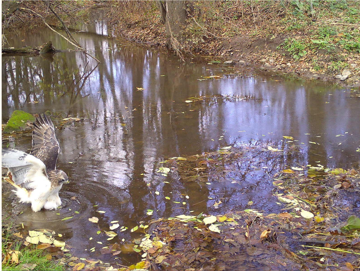
Red-tailed hawk Buteo jamaicensis