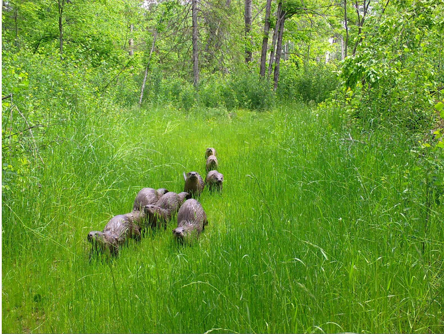
River otter Lontra canadensis