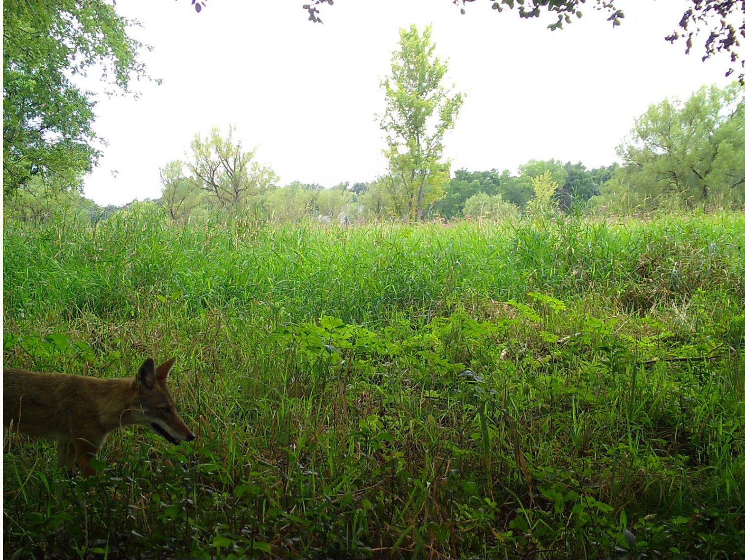
Coyote Canis latrans