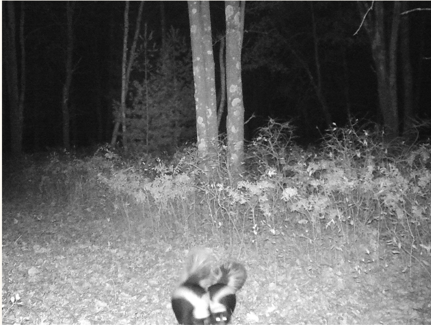
Striped skunk Mephitis mephitis