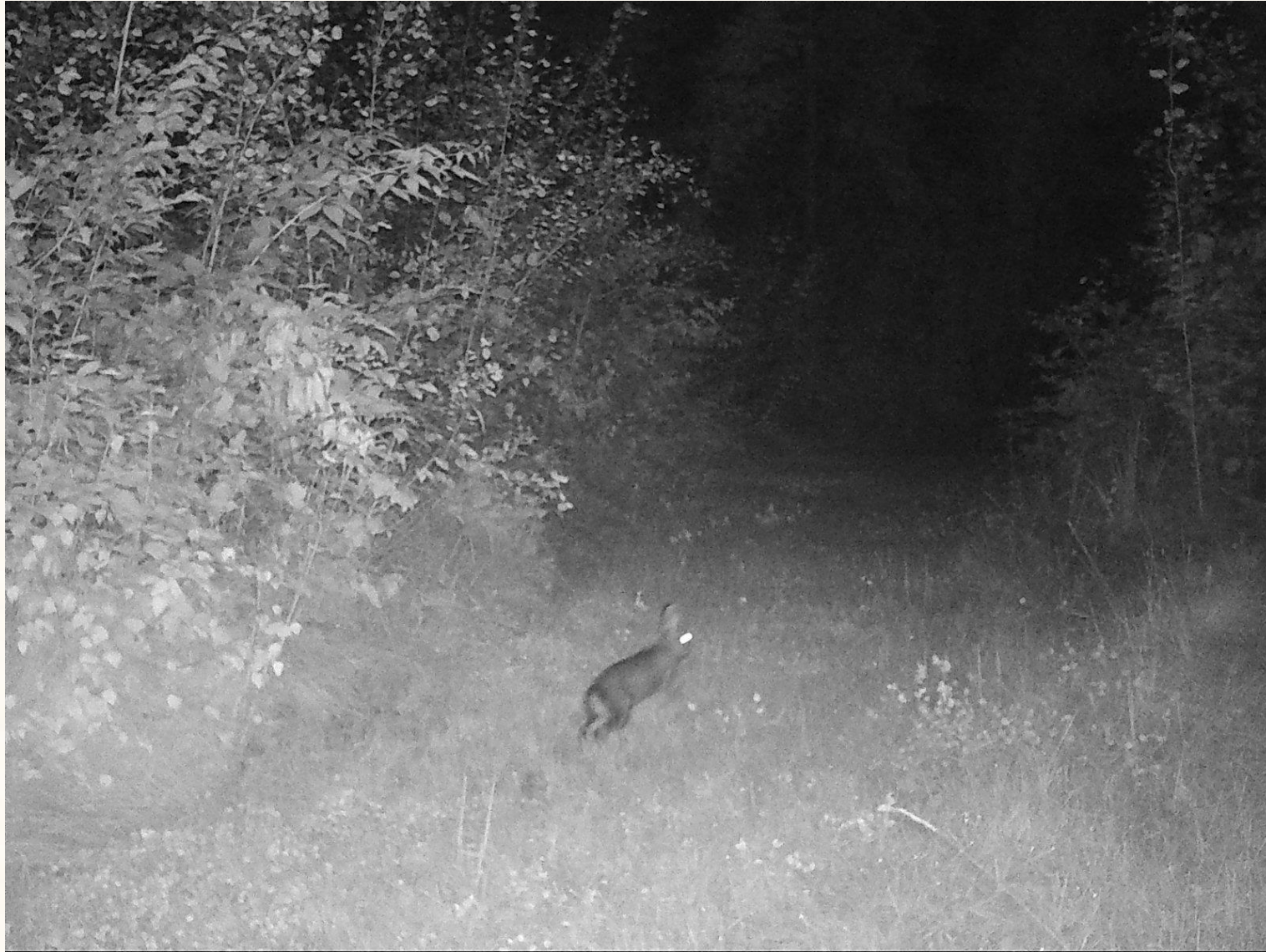
Snowshoe hare Lepus americanus