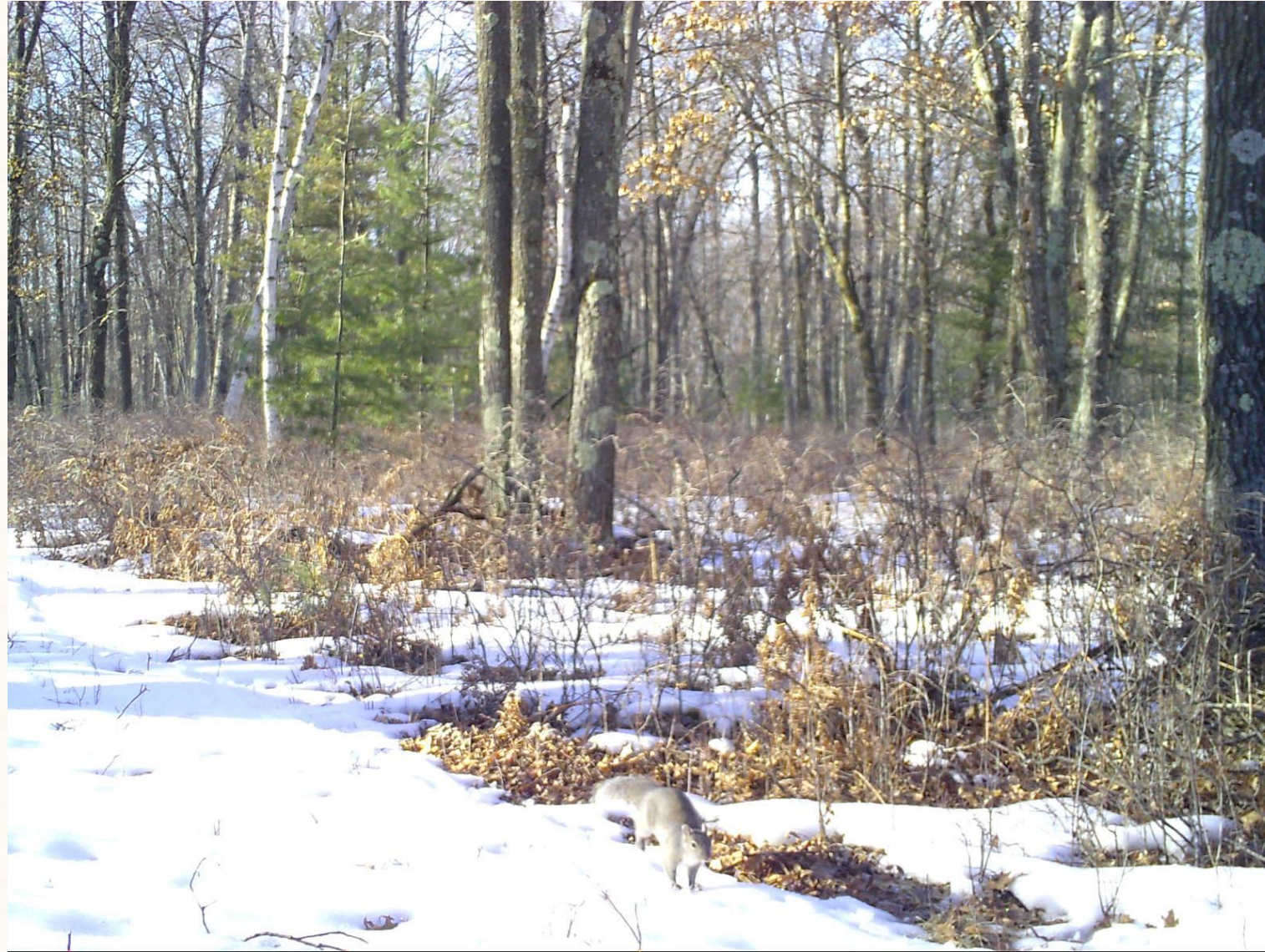
Easter gray squirrel Sciurus carolinensis