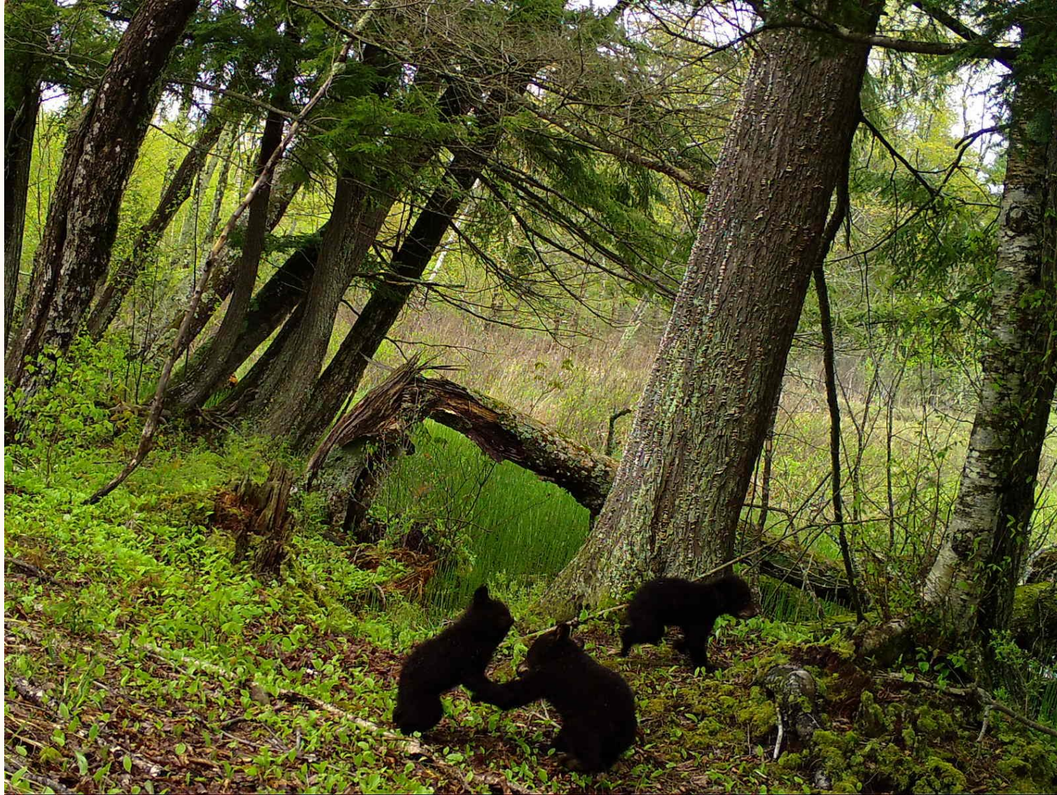
Black bear Ursus americanus