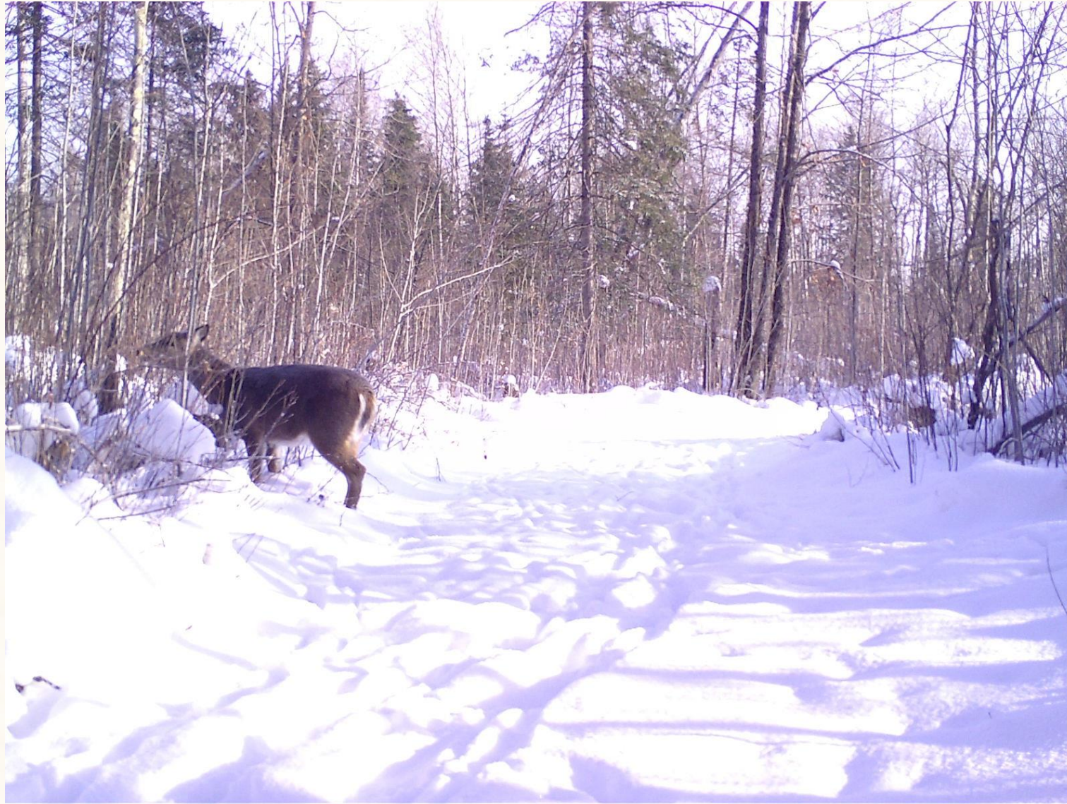
White-tailed deer Odocoileus virginianus