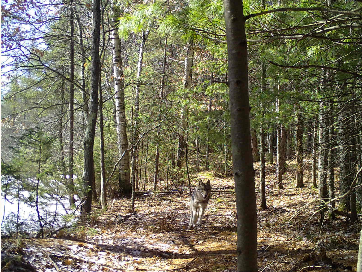
Gray wolf Canis lupus