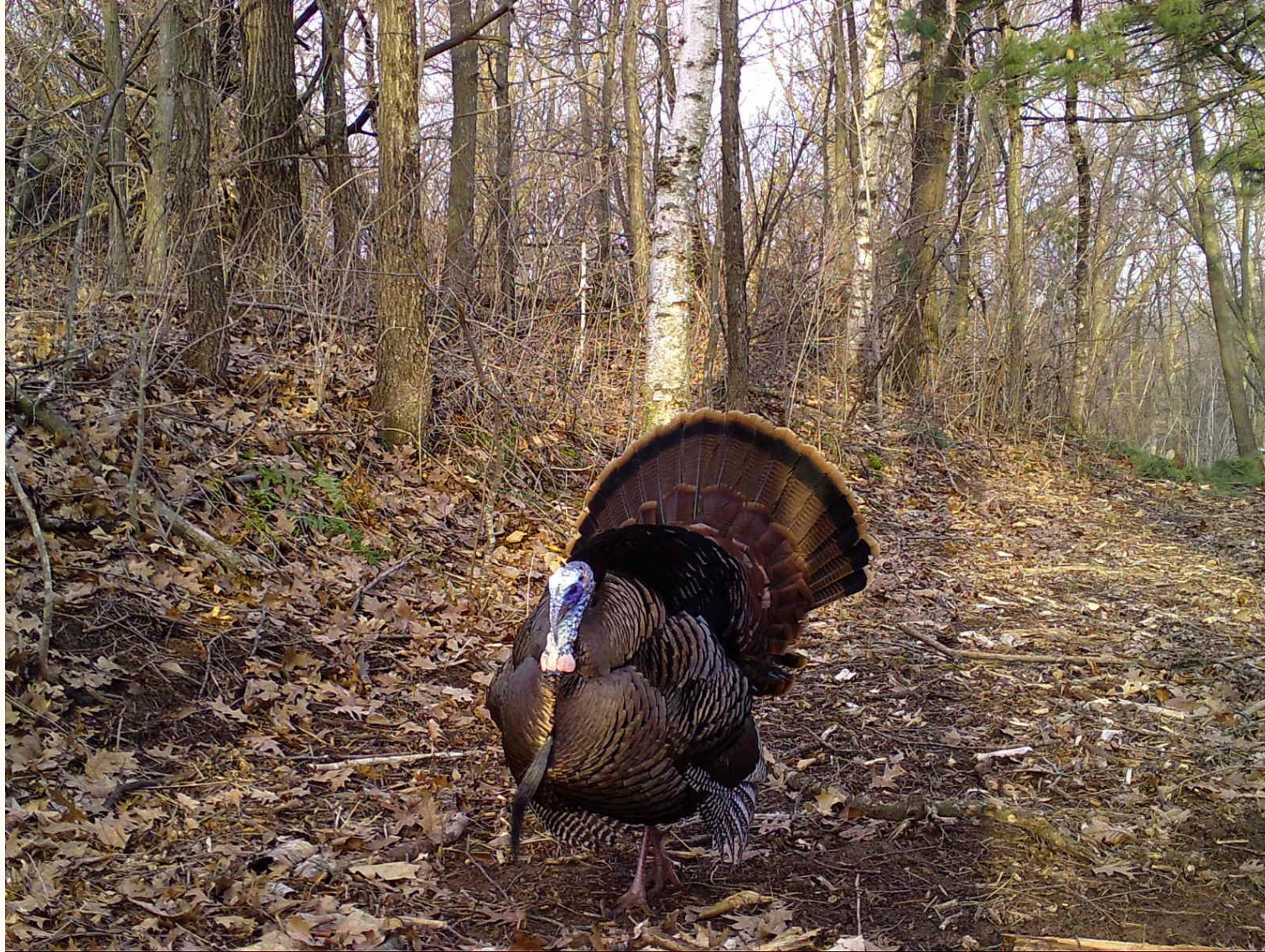
Wild turkey Meleagris gallopavo