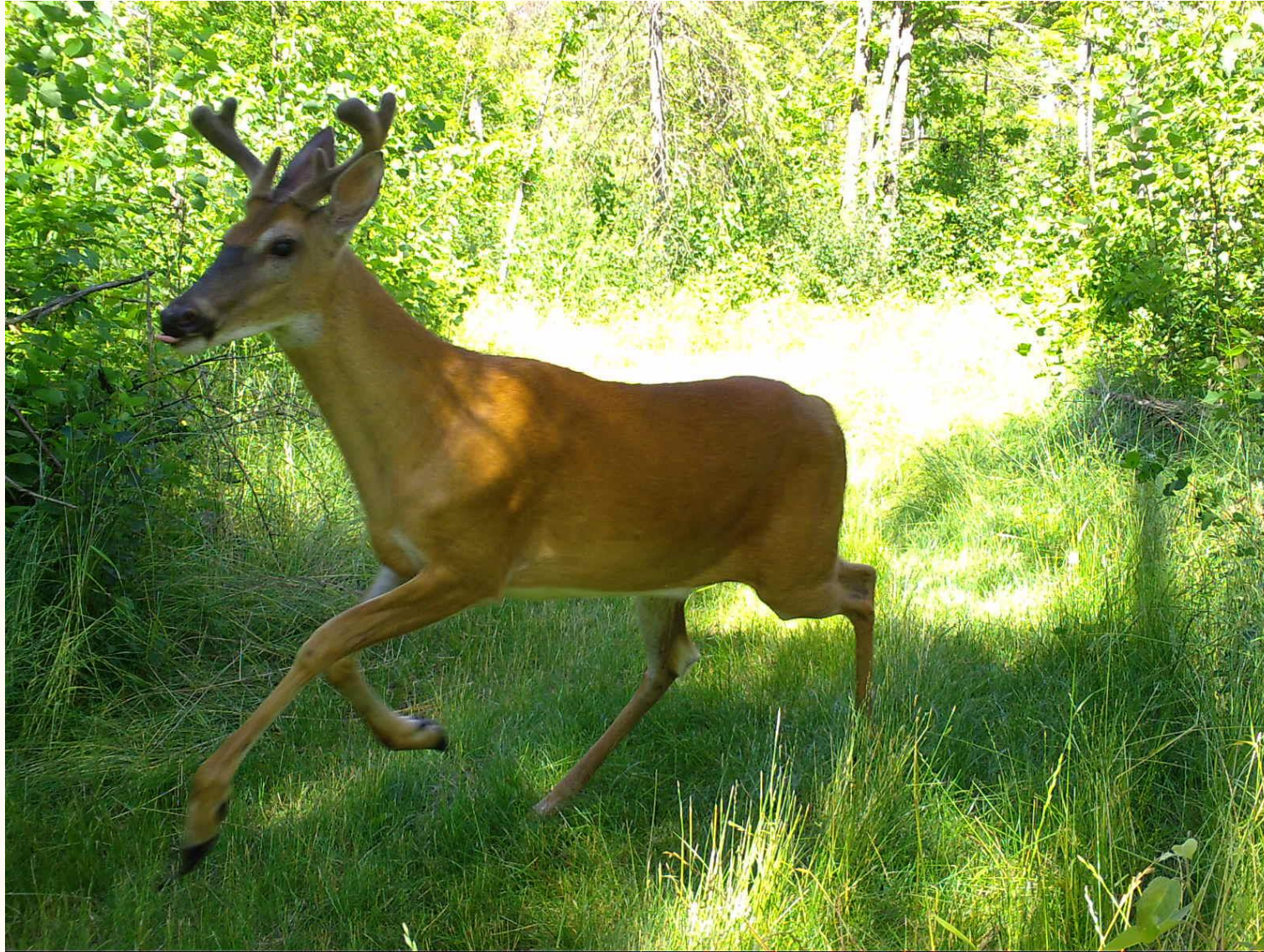
White-tailed deer Odocoileus virginianus