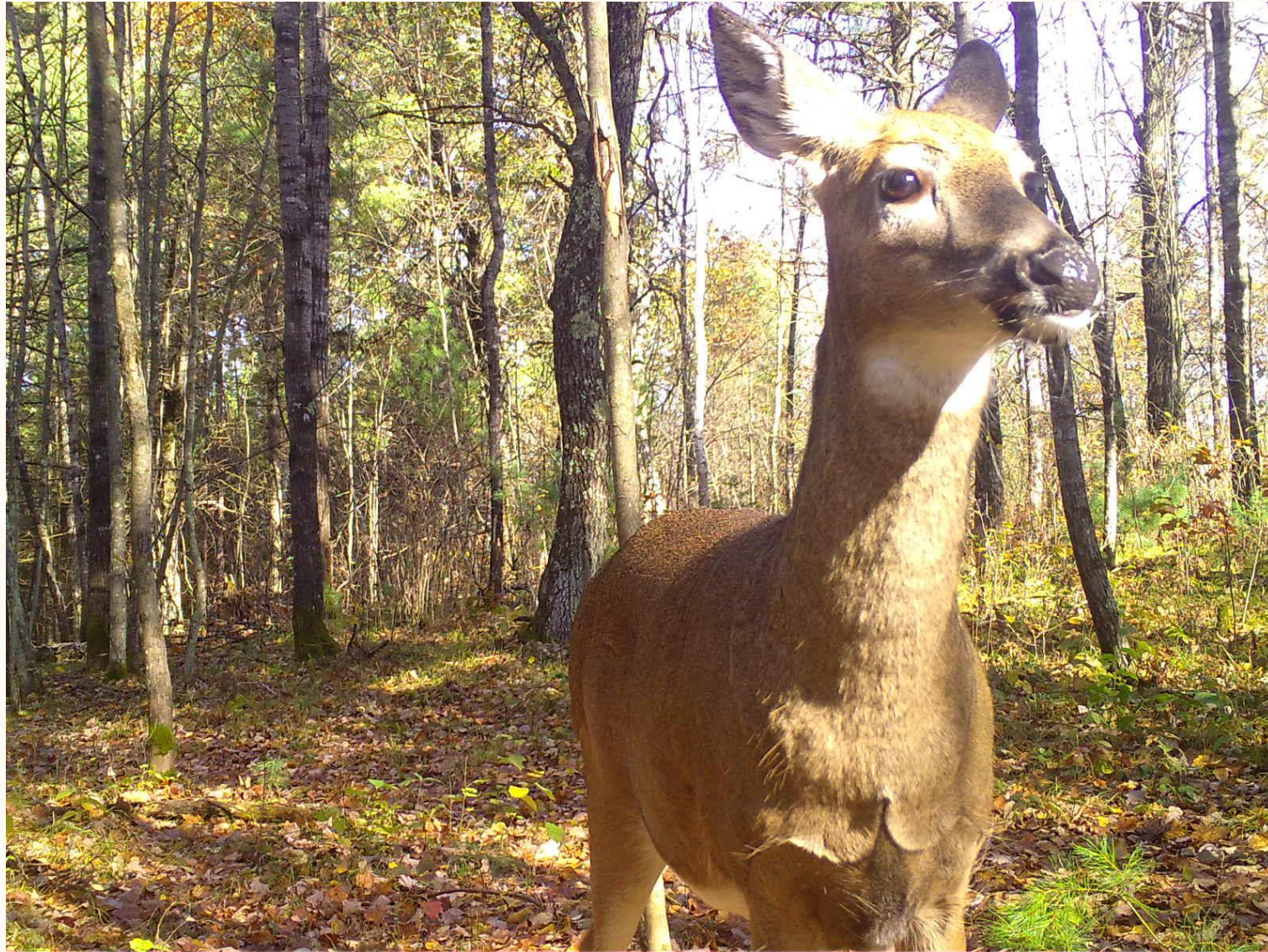
White-tailed deer Odocoileus virginianus