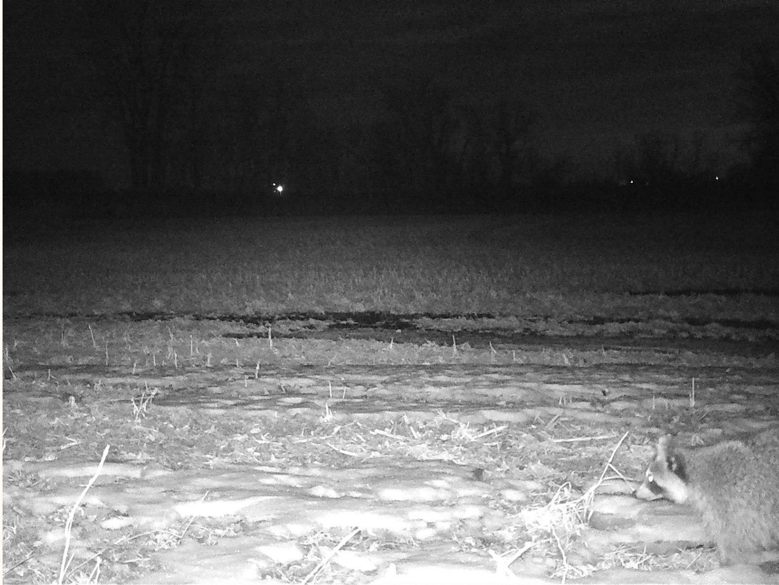
Raccoon Procyon lotor