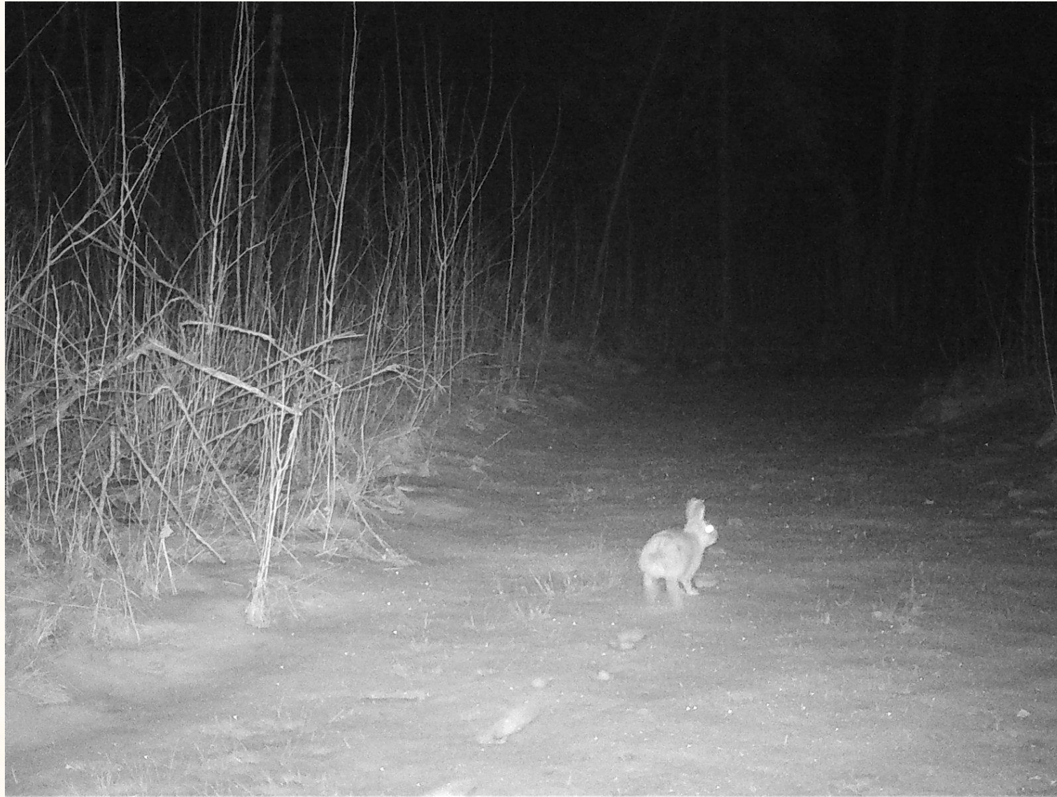
Snowshoe hare Lepus americanus