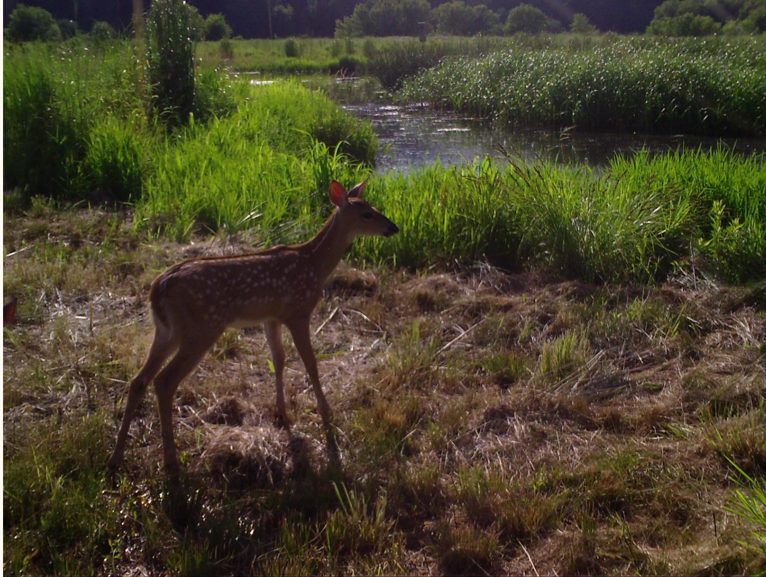
White-tailed deer Odocoileus virginianus