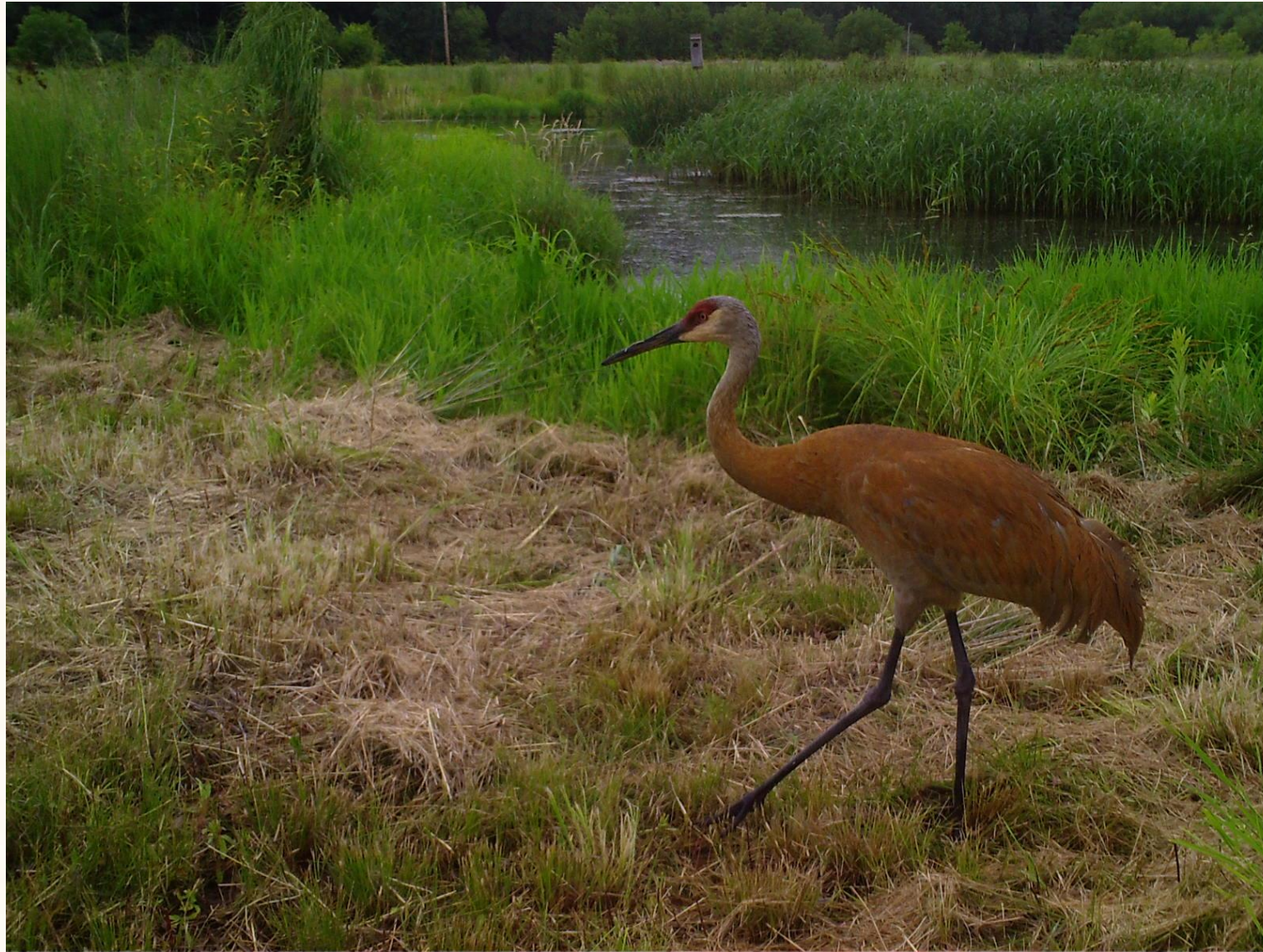
Sandhill crane Grus canadensis