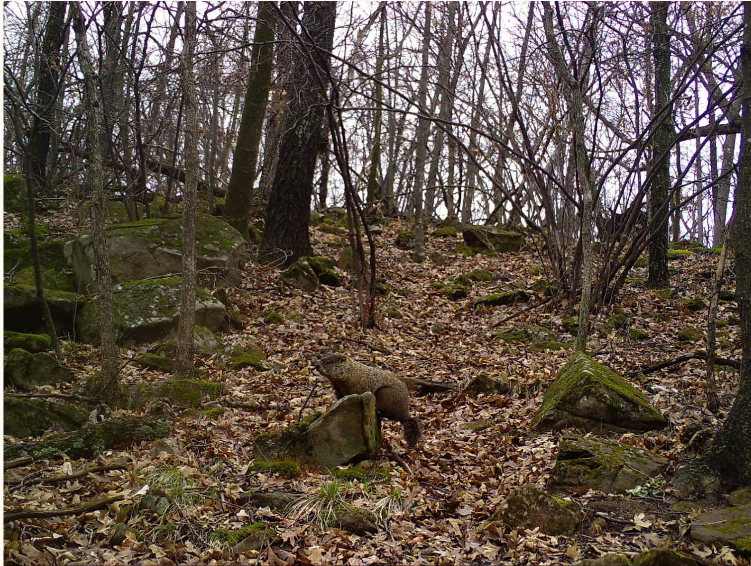
Woodchuck Marmota monax