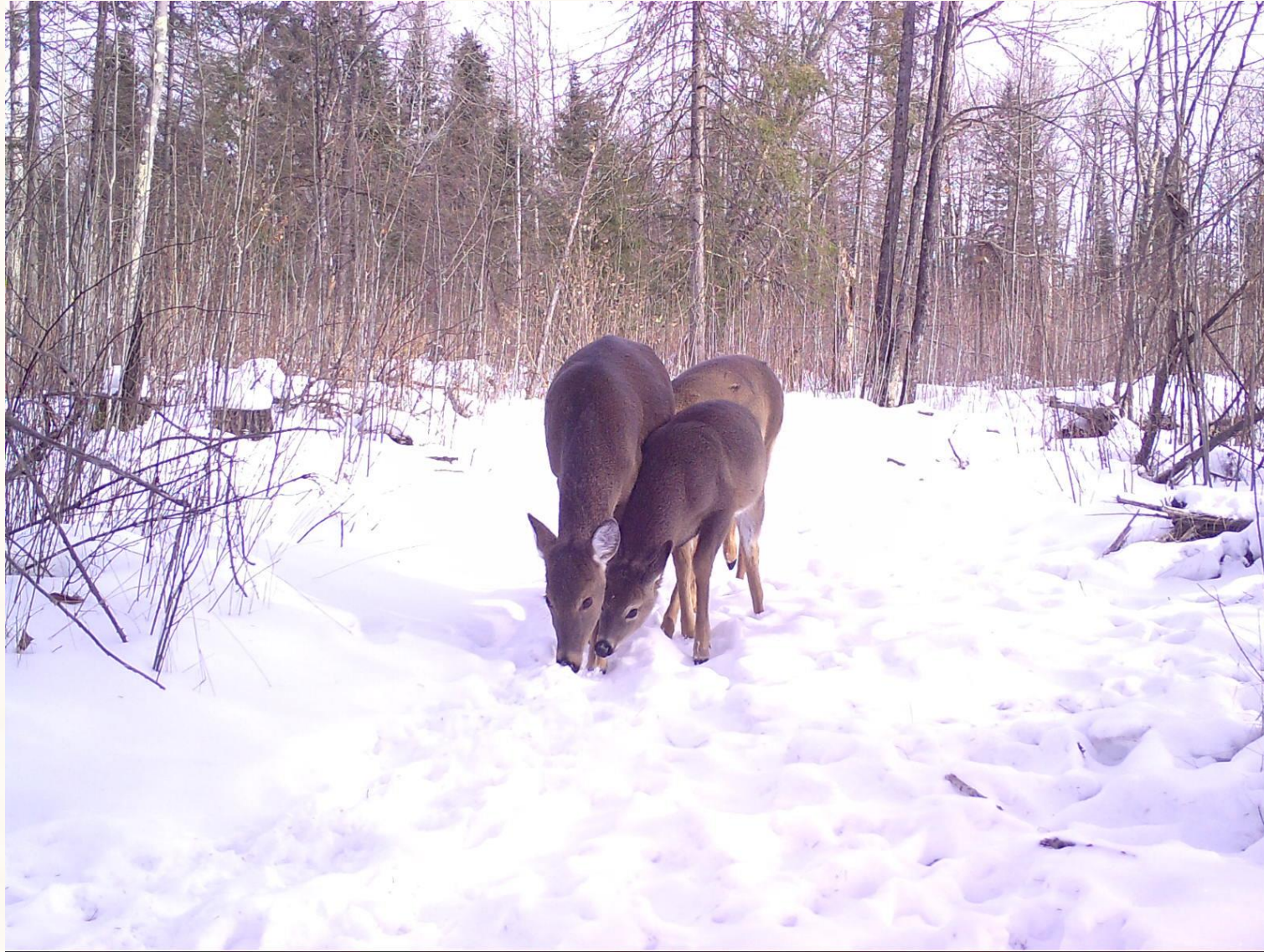
White-tailed deer Odocoileus virginianus